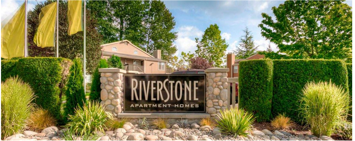
Riverstone Apartment Complex in Federal Way.